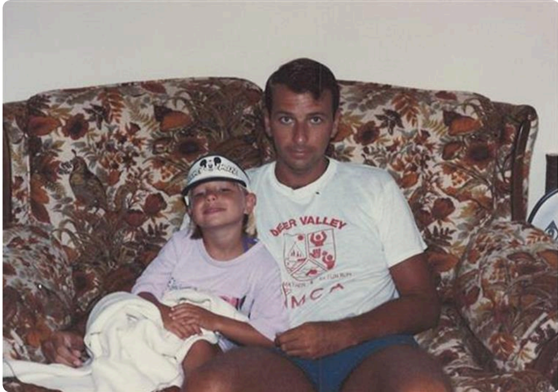
My father and I